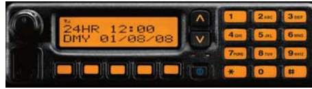
Internal clock setting example

With a high contrast dot matrix display, upper and lower case characters can be easily distinguished. The display shows 12 characters by 2 lines. LCD backlight is standard.