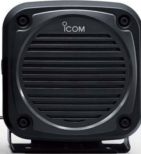
Photo includes optional RMK-4, OPC-607, SP-22, SP-30 and HM-148G.